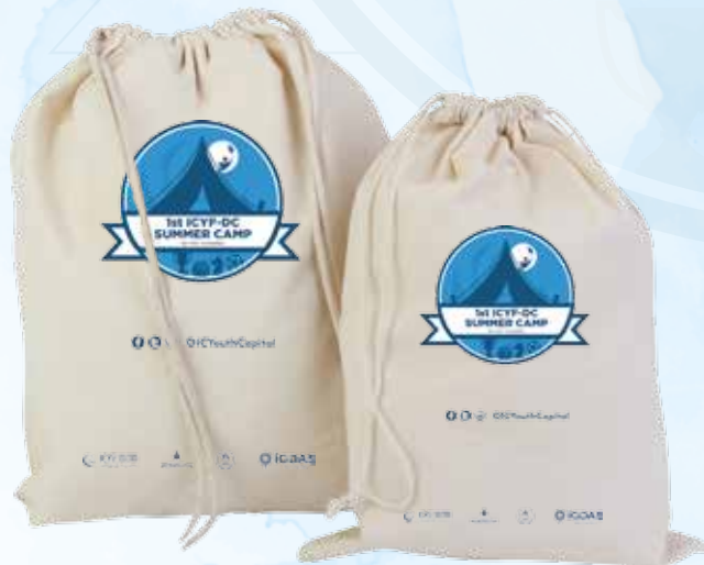
19.6. Canvas Backpack